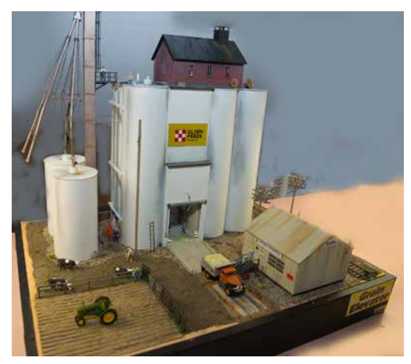
One of the models from the September contest.

Official newsletter of Division Four, Mid Central Region of the National Model Railroad Association.